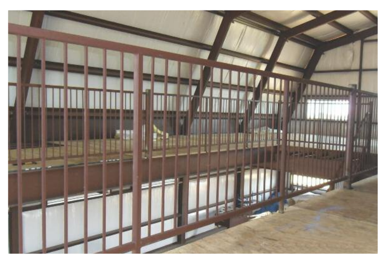
Beautiful and safe custom railings complement the design of your building.