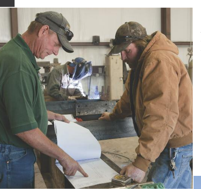
Our drafting detailing and engineering expertise produces a building that fits your needs and includes your custom features.