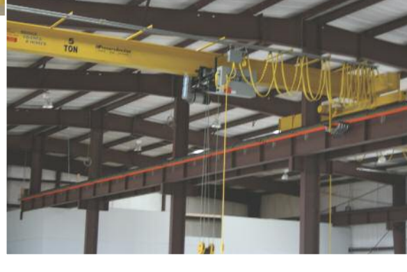
Young's Building Systems has all the equipment and knowledge needed to tackle any variety of projects.