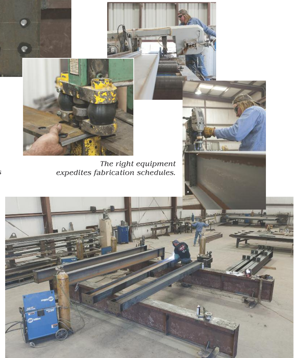
Our spacious 13,000 sq. ft. workshop allows us to fabricate framework that expedites erection on your site in record time.