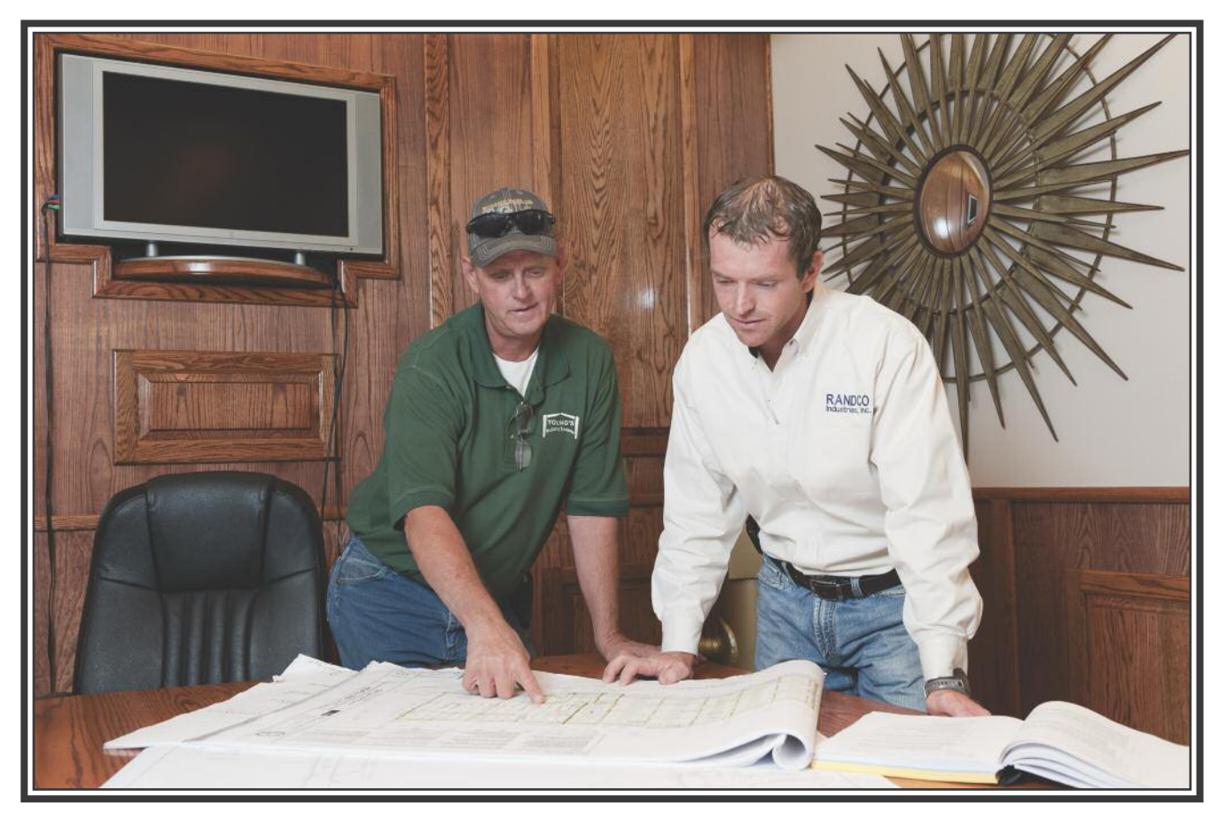
Precise hands on project management by our propritory team is a trademark quality that assures your job will be on schedule and to your specifications.